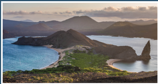
5-Day Luxury Yacht Cruise Through The Galapagos