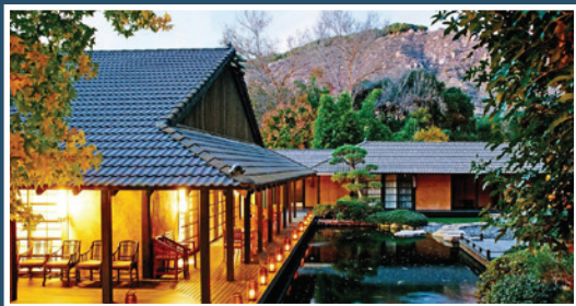
Golden Door 5 Day Rejuvenating Getaway