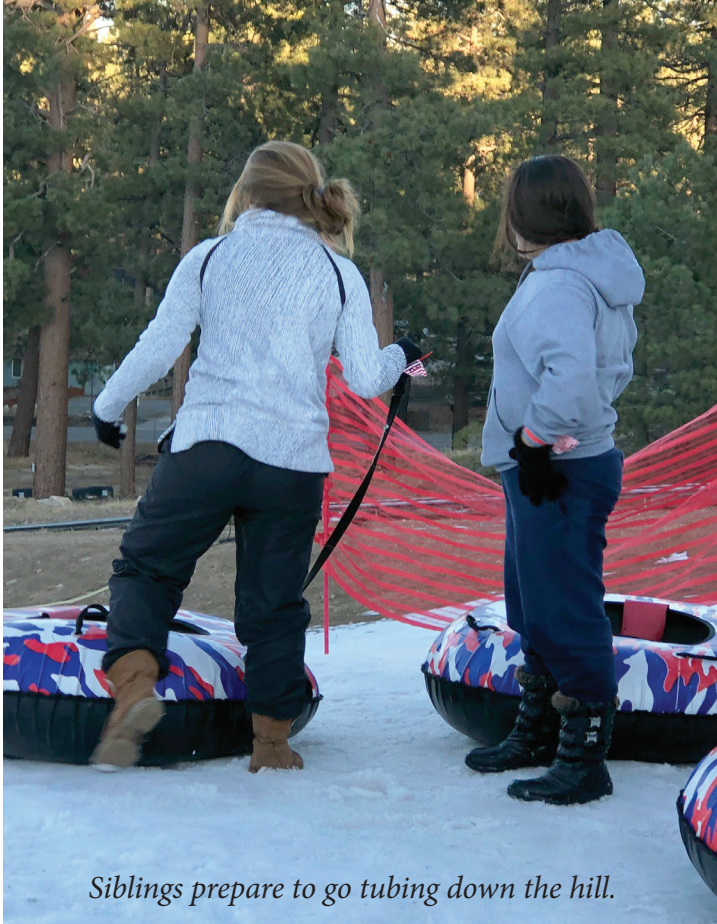
Siblings prepare to go tubing down the hill.

Last month, local foster children had the opportunity to enjoy an overnight getaway in the beautiful city of Big Bear. For the majority, this was their very first time seeing snow. Needless to say, there was no shortage of snow angels, snowmen and snowball fights. The weekend was full of fun activities!